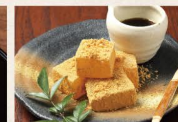
Warabi-Mochi 500 -Bracken-starch dumpling- わらび餅