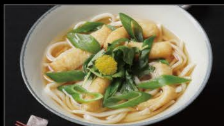
Shinoda Udon 1200 しのだうどん Fried Bean Curd / Scallions