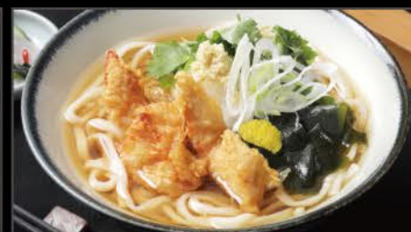
Chicken Tempura Udon 1250 とり天うどん Chicken Tempura / Scallions / Seaweed Grated Daikon-Radish / Minced Ginger