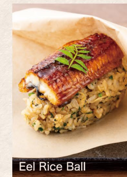
Eel Rice Ball