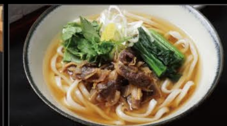
Meat Udon 1500 肉うどん Braised Beef / Scallions / Minced Ginger