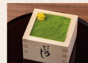
Yame Matcha Tiramisu 750 八女抹茶の升ティラミス