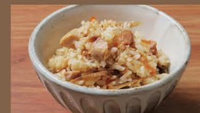
Kashiwa-Meshi かしわ御飯 -Chicken Rice with Various Ingredients-