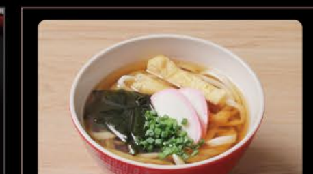
Kid's Udon 600 with Jelly & Orange Juice お子様うどん [ゼリー&オレンジジュース付] Fried Bean Curd / Fish Cake / Seaweed