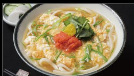
Egg with Spicy Cod Roe 1500 over Udon 明太玉子とじうどん Egg / Spicy Cod Roe / Scallions Mitsuba (Japanese Parsley) / Minced Ginger