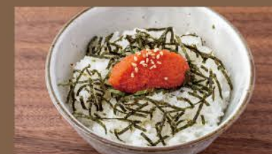
Spicy Cod Roe Rice 辛子明太子御飯