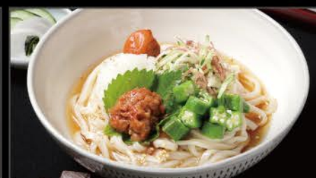
Chilled Udon 1250 with Ume-Plum and Grated Daikon-Radish 冷やし梅おろしうどん Ume-Plum / Grated Daikon-Radish Green Shiso / Okra / Sesame